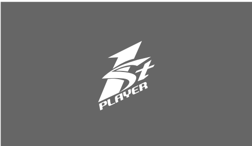
PC GAMING CASE FD8