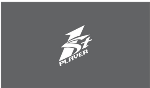
NEO87-RN-TCB ROSE NEBULA